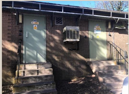
5 independent secure rooms