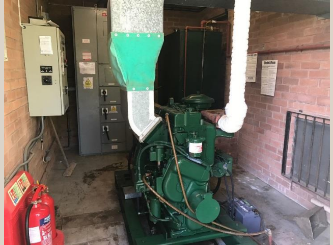
Generator housed within an internal room