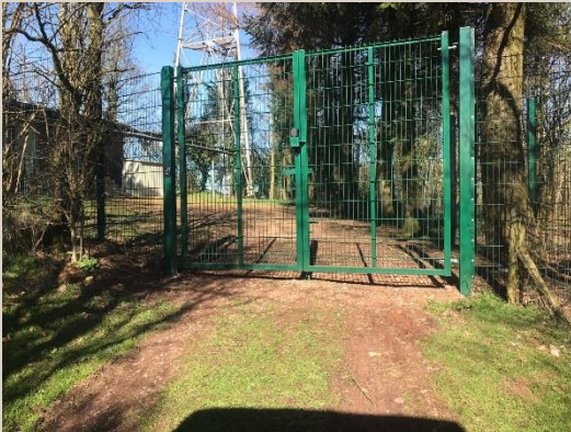
New perimeter fencing and access control

A valuable investment opportunity to acquire an active telecommunications site in Herefordshire comprising of the telecommunications tower and land. Recent improvements have been made at significant cost in renewing the electrical distribution system, providing new perimeter security fencing (anti-climb) and electronic access control which enables remote monitoring, permitting access via a swipe card. The site extends to approximately 360sqm.