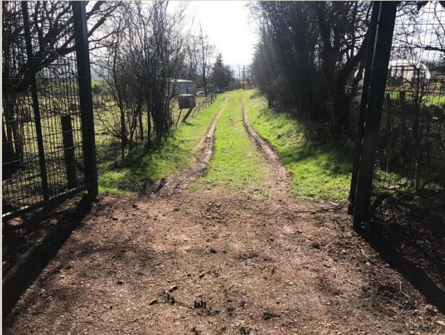
Access Route as viewed from the site entrance